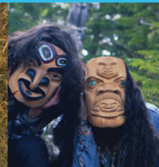
SNOTTY NOSE REZ KIDS